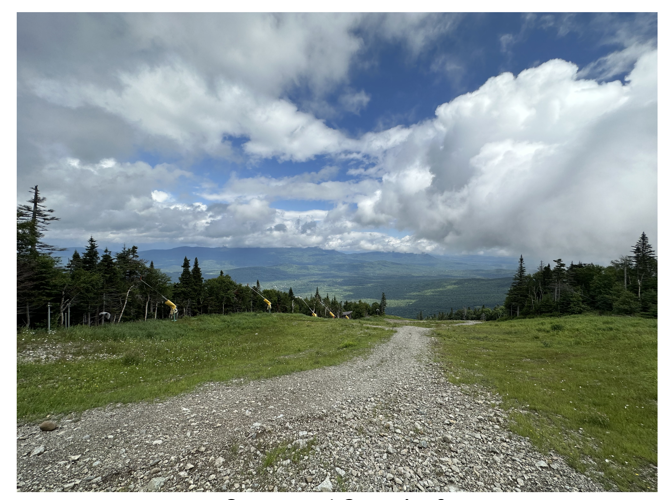
Summer at Sugarloaf

The 46th annual Maine Area Round Up is right around the corner! This year's gathering will be held the second weekend in June, once again in the picturesque and magical Carrabassett Valley. HERE is the website with more information, and a registration page going live in mid-February. It is sure to be a weekend chock full of fellowship, inspirational speakers, workshop wisdom, and the marvelous vistas at Sugarloaf Mountain.