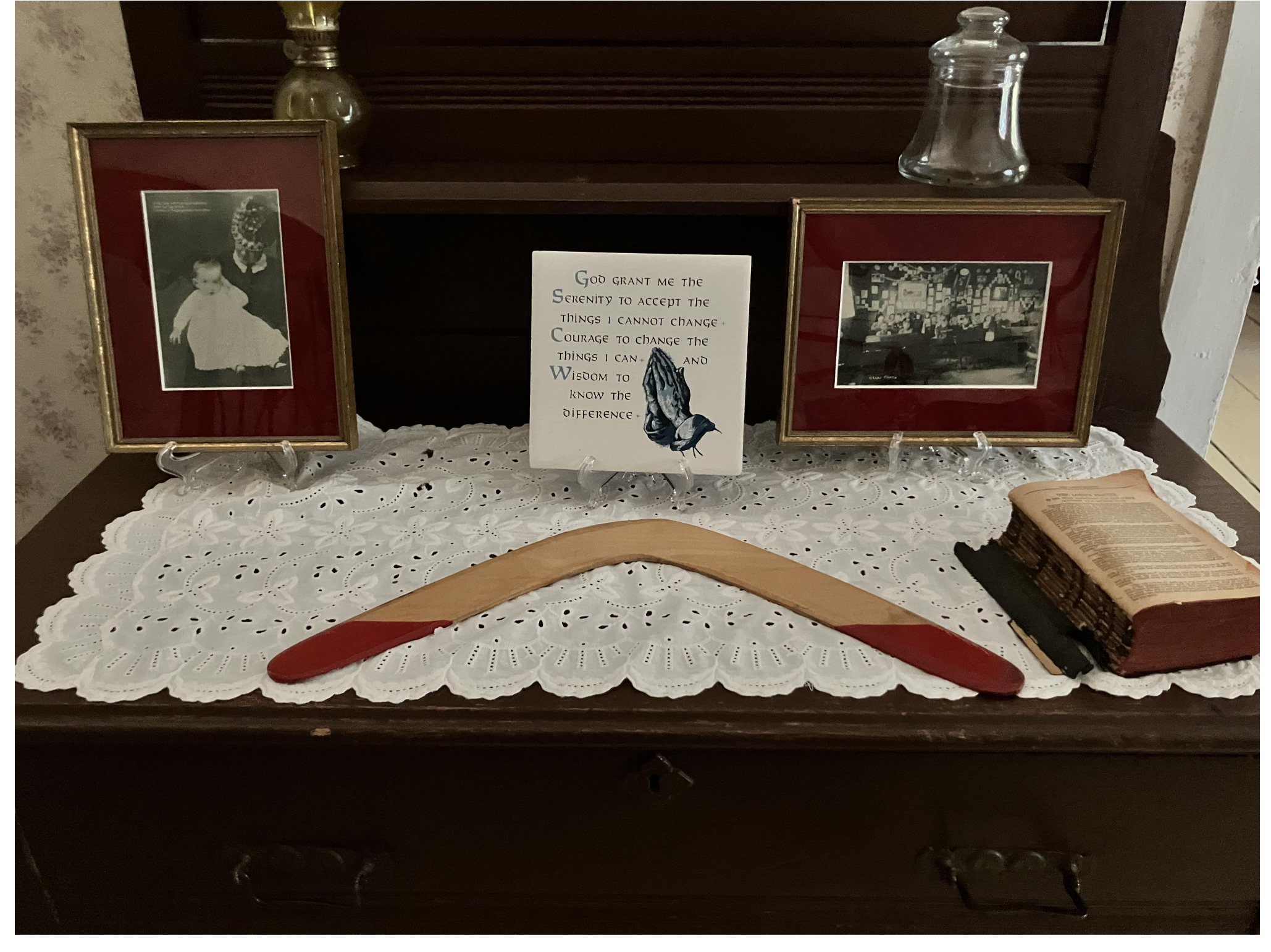
The Boomerang of Legend (allegedly)